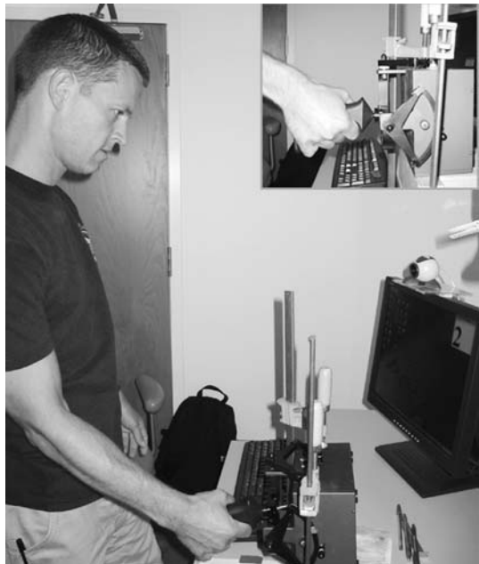
Fig. 1 A user interacting with the virtual interpersonal touch device

Participants were undergraduate students who received 10 dollars each for participation. Forty-eight were female (24 in the mimic condition, 24 in the normal condition) and 42 were male (21 in the mimic condition, 21 in the normal condition). Experimental